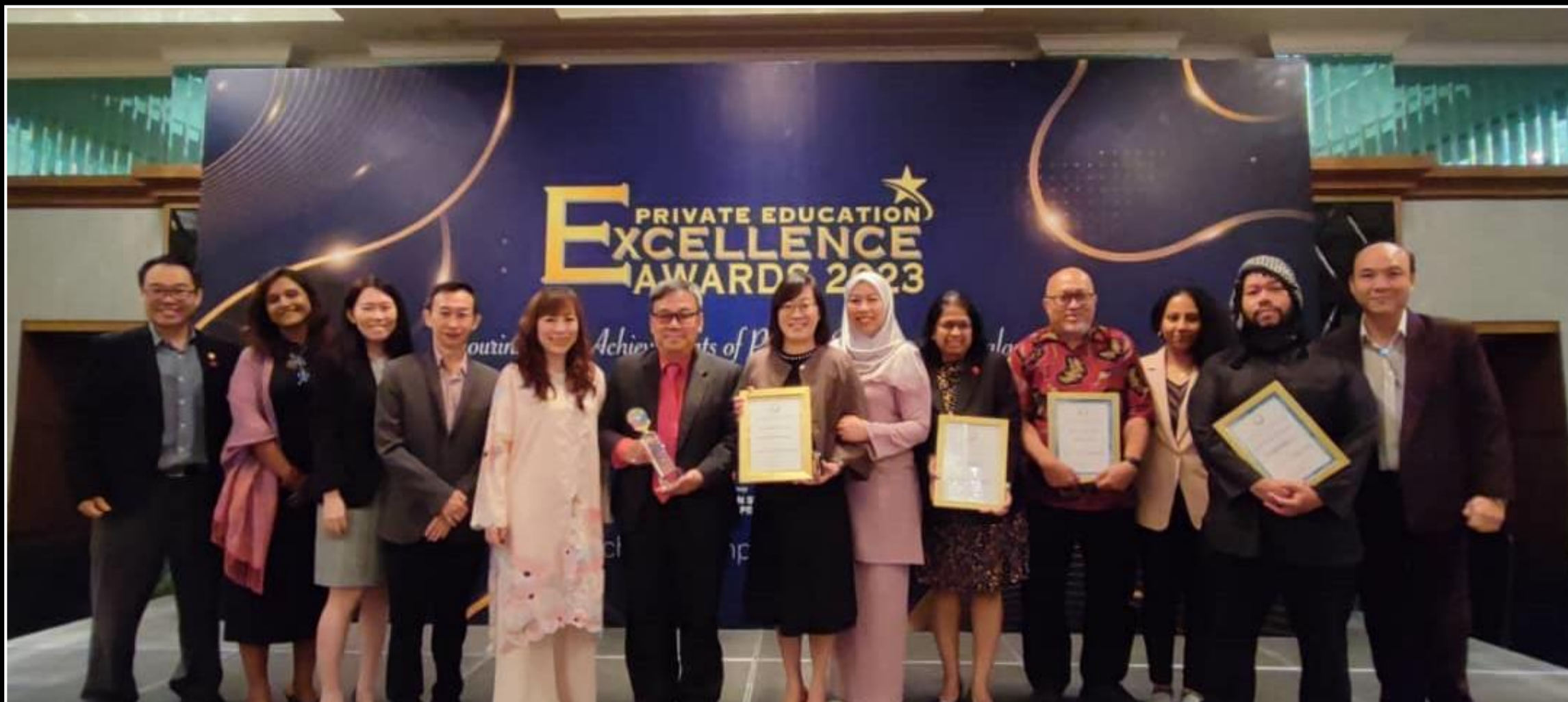
Prestigious Institutional Award at the Private Education Excellence Awards 2023 2023年私立教育卓越奖的杰出机构奖