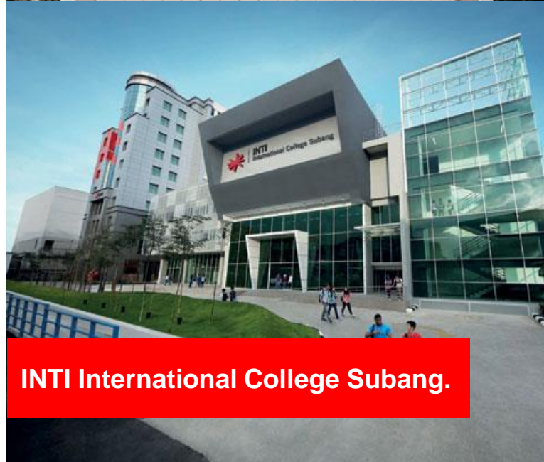
INTI International College Subang.