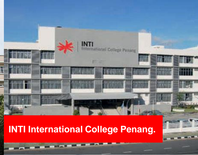
INTI International College Penang.