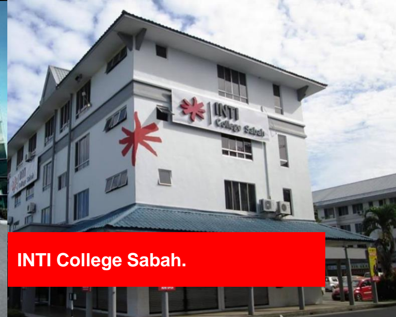
INTI College Sabah.