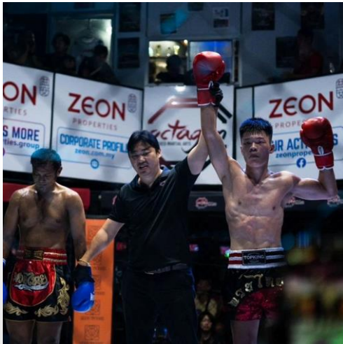
Hybrid Cage Boxing