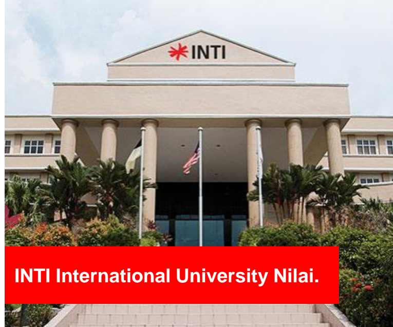
INTI International University Nilai.